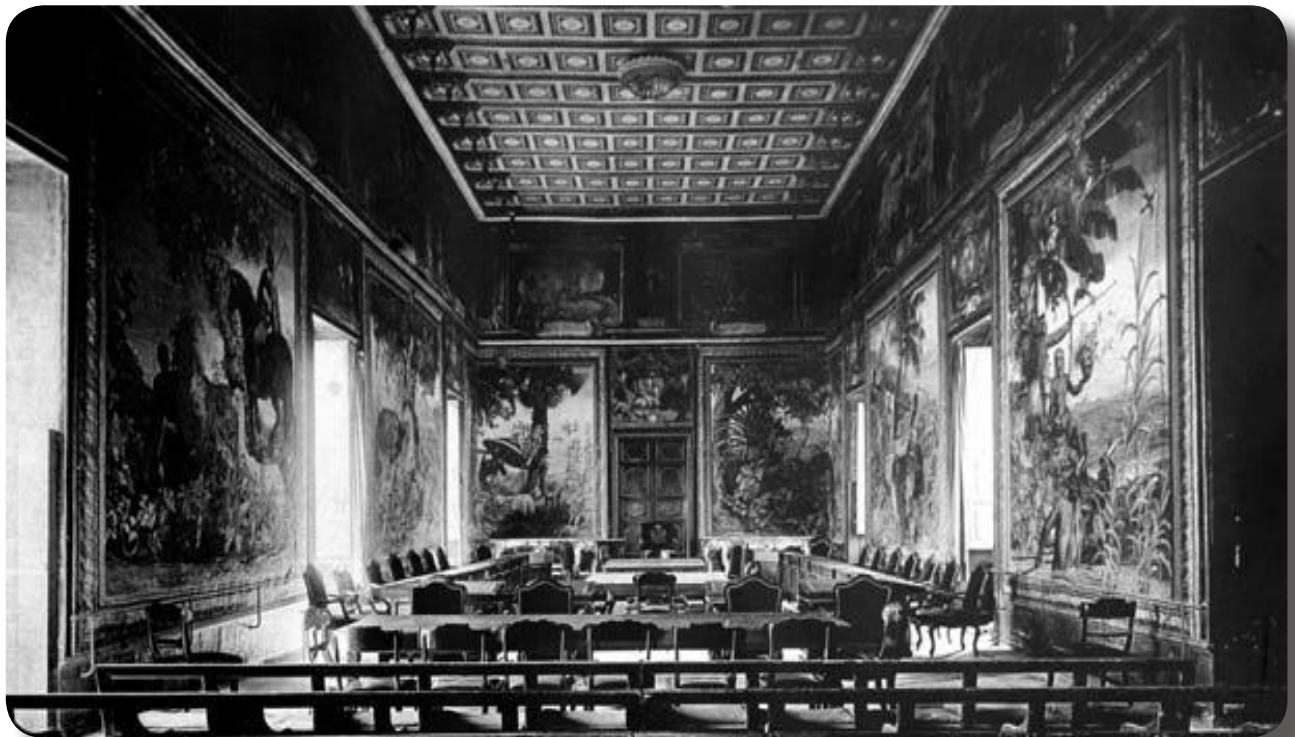
Is-Sala tal-Arazzi fil-Palazz tal-Gran Mastri li fiha ltaqgħet l-Assemblea Legiżlattiva mill-1921 sal-1964 u l-Kamra tad-Deputati mill-1964 sal-1976.