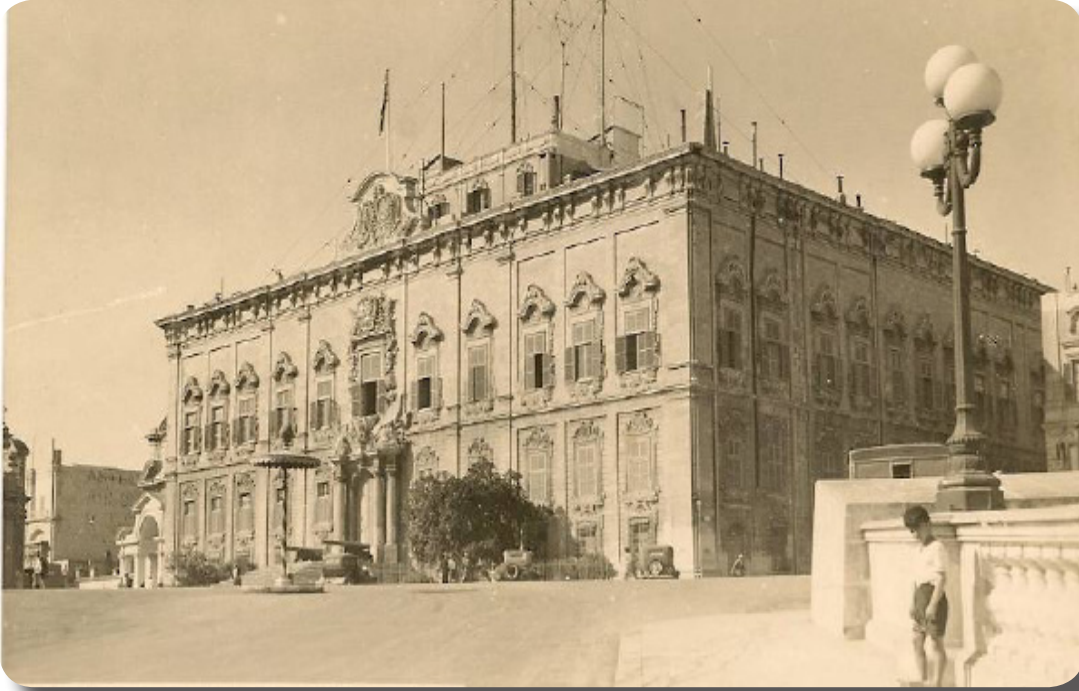
Veduta tal-Berga ta' Kastilja li mis-snin 20 kienet wiehed mis-siti potenzjali għall-binja tal-Parlament.