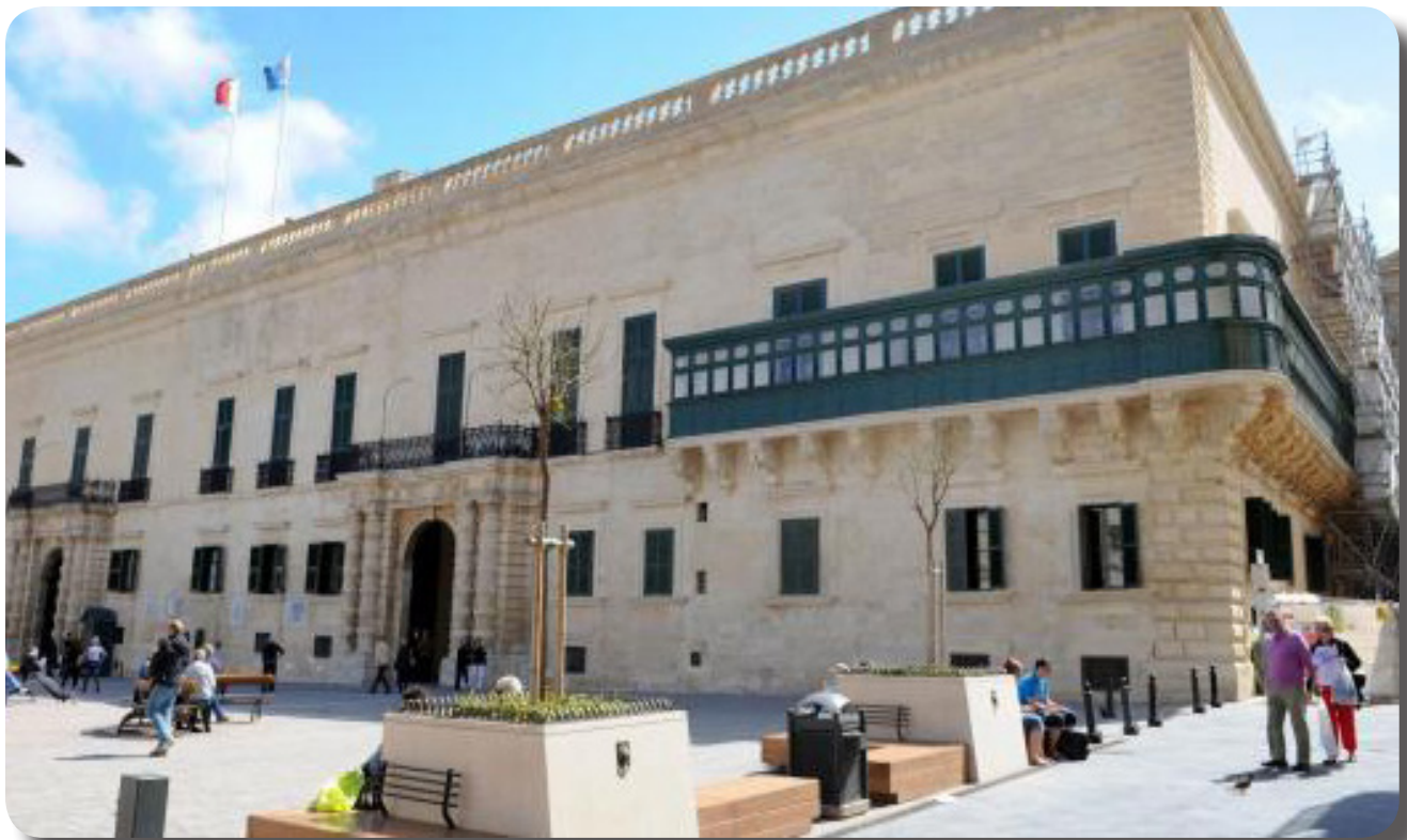
The Grand Masters' Palace which has been the seat of Parliament until May 2015.