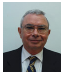
Il-Prof. Godfrey A. Pirotta huwa Professur fil-Public Policy fil-Fakultà tal-Ekonomija, il-Management u l-Accounts (FEMA) u Direttur tal-Istitut tal-Amministrazzjoni Pubblika u l-Management fl-Università ta' Malta.

iv Dibattiti tal-Assemblea Legiżlattiva, 17 Nov. 1922. v Dibattiti tal-Assemblea Legiżlattiva, 5 Jan. 1922. vi Dibattiti tal-Assemblea Legiżlattiva, 24 Nov. 1924. vii Dibattiti tal-Assemblea Legiżlattiva, 26 Frar. 1925. viii Dibattiti tal-Assemblea Legiżlattiva, 4 Mejju 1925. ix UPM: Unione Politica Maltese; CP: Constitutional Party; LP: Labour Party; PDN: Partito Democratico Nazzionalista. x Dibattiti tal-Assemblea Legiżlattiva, 14 Mejju 1925. xi Dibattiti tal-Assemblea Legiżlattiva, 28 Mejju 1925. xii Dibattiti tal-Assemblea Legiżlattiva, 15 Ġun. 1925. xiii Dibattiti tal-Assemblea Legiżlattiva, 15 Diċ. 1925. xiv Dibattiti tal-Assemblea Legiżlattiva, 17 Frar 1926. xv Dibattiti tal-Assemblea Legiżlattiva, 23 Frar 1926. xvi Dibattiti tal-Assemblea Legiżlattiva, 16 Mar. 1926. xvii Dibattiti tal-Assemblea Legiżlattiva, 22 Mar. 1926. xviii Dibattiti tal-Assemblea Legiżlattiva, 25 Ott. 1926. xix Ibid. xx Dibattiti tal-Assemblea Legiżlattiva, 8 Nov. 1926. xxi Dibattiti tal-Assemblea Legiżlattiva, 6 Diċ. 1926. xxii Dibattiti tal-Assemblea Legiżlattiva, 12 Diċ. 1926.