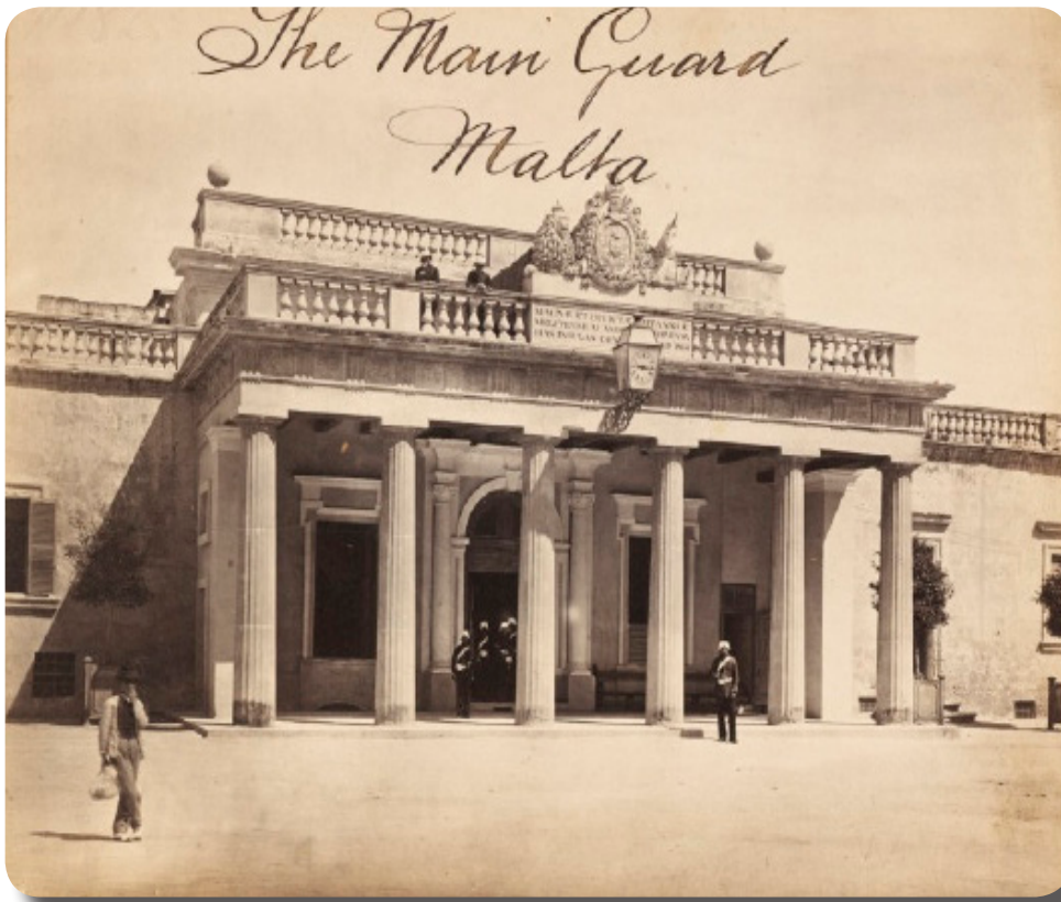
The Main Guard building which was one of the potential sites considered for the relocation of Parliament.