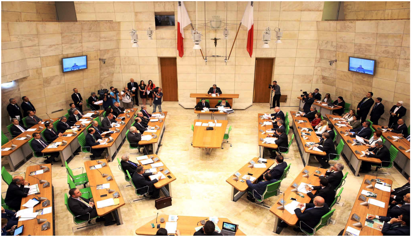
L-ewwel seduta parlamentari li nżammet fil-binja l-ġdida li giet miftuħa b’mod uffiċjali fl-4 ta’ Mejju 2015.