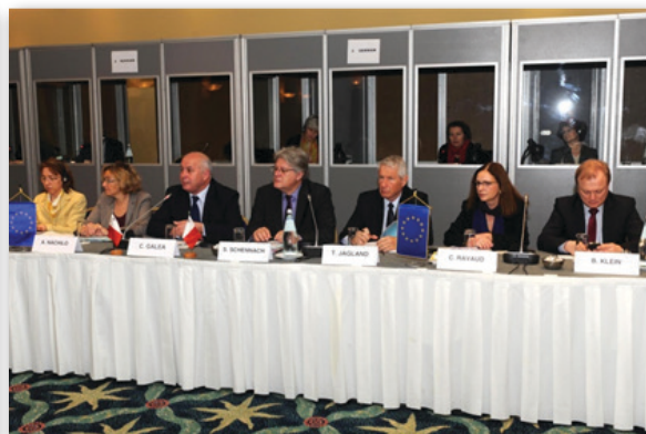
Laqgħa tal-Kumitat dwar ir-Rispett tal-Obbligi u l-Impenji mill-Istati Membri tal-Kunsill tal-Ewropa (Kumitat ta' Monitoraġġ)

Il-Kumitat iltaqa' ħames darbiet: fl-ewwel tliet laqgħat il-Kumitat iddiskuta l-prinċipji li għandhom ikunu ta' bażi għal-leġiżlazzjoni eventwali, u kkunsidra numru ta' sistemi mhaddma f'parlamenti oħra; fl-aħħar żewġ laqgħat il-Membri ddiskutew abbozz ta' liġi ppreparat mill-Uffiċċju tal-Avukat Ġenerali, ibbażat fuq id-deċiżjonijiet tal-istess Kumitat fl-ewwel tliet laqgħat. Hekk kif il-Membri kollha tal-Kumitat jaqblu dwar it-test tal-abbozz, dan tqiegħed fuq il-Mejda tal-Kamra mill-Ispeaker, sabiex matul din is-sena jgħaddi mill-istadji tal-process leġiżlattiv fil-Kamra.