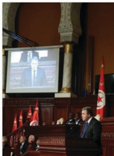
L-Ispeaker Anġlu Farrugia jindirizza l-parteċipanti tas-sessjoni straordinarja tal-Assemblea Nazzjonali Kostitwenti Tuneżina

Għal din l-okkażjoni kienu preżenti għadd ta' dinjitarji minn madwar id-dinja. Fl-indirizz tiegħu lill-Assemblea l-Ispeaker Farrugia feraħ lill-poplu Tuneżin u lill-awtoritajiet għal dan l-iżvilupp politiku importanti li għandu jservi ta' eżempju għal pajjiżi oħra fir-reġjun. Huwa rrefera għall-elezzjonijiet li għandhom isiru din is-sena bħala għan politiku kruċjali għat-tiħ tal-proċess tranżizzjonali lejn id-demokrazija fit-Tuneżija, u qal li Malta tappoġġja dan il-proċess.