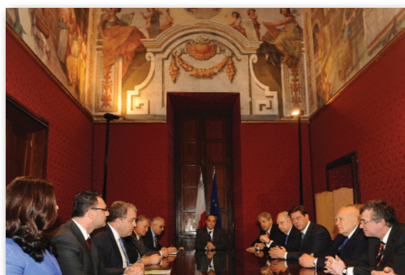
Meeting with the President of the Hellenic Republic

This first publication was also presented to the Prime Minister, Hon. Joseph Muscat, and to the Leader of the Opposition, Hon. Simon Busuttil, as leaders of their respective parliamentary groups.