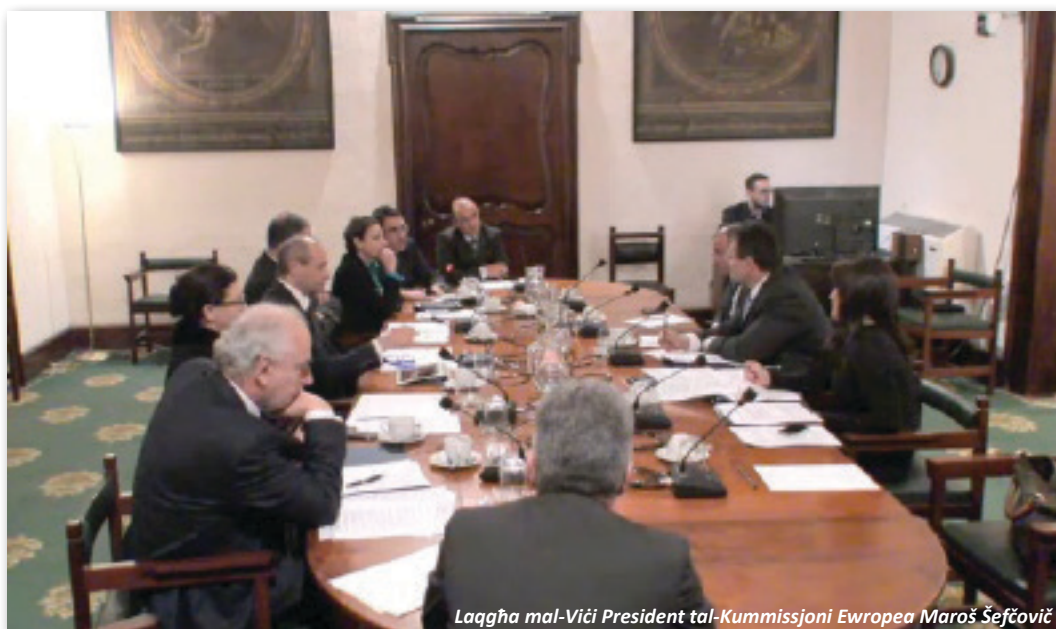
Laqgħa mal-Viċi President tal-Kummissjoni Ewropea Maroš Šefčovič

F'dak li għandu x'jaqsam ma' skrutinju, il-Kumitat adotta l-prassi li jevalwa l-pożizzjoni meħuda mill-Gvern fil-Kabinet u jew jaqbel mal-pożizzjoni li jkun ha l-Gvern jew inkella jikkomunika t-tħassib tiegħu lill-Gvern sabiex jieħu nota tagħhom fid-diskussjonijiet fil-livell tal-gruppi ta' hidma u tal-Kunsill.