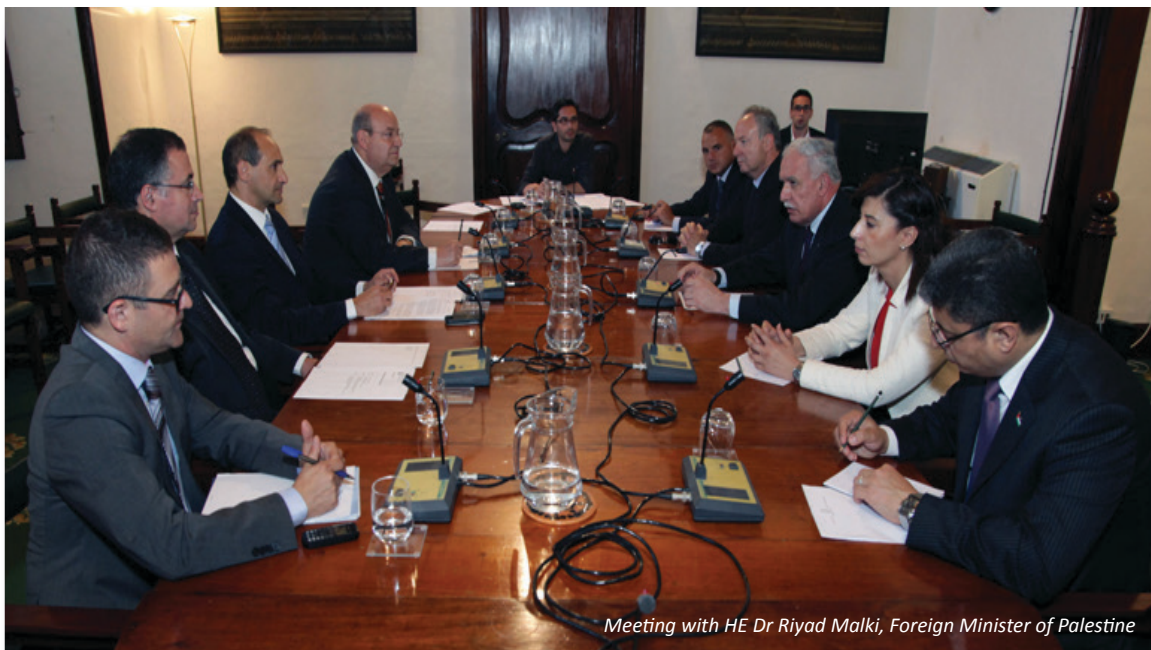
Meeting with HE Dr Riyad Malki, Foreign Minister of Palestine

The composition of this Committee is of particular relevance in that besides Members of Parliament from both sides of the House, the Minister of Foreign Affairs is also ex-officio member and the Maltese Members of the European Parliament (MEPs) are also non-voting members. The purpose behind this set up is for the Committee to be kept continuously informed on issues discussed at the Council of Ministers (Foreign Affairs) and on issues on the agenda of the European Parliament. The Minister of Foreign Affairs regularly briefs the Committee on current issues at EU and at global levels and, as far as practicable, he also endeavours to relate with the Committee prior to Council meetings so that he will take with him the views expressed by its members. I must however confess that the participation and input of our MEPs in the work of the Committee has so far during this legislature, and even in previous ones, been almost non-existent but, to be fair, one must acknowledge that the main reason for this lies in the fact that our House of Representatives and the European Parliament meet practically on the same days of the week and therefore MEPs are away from the island attending to their duties in Brussels or Strasbourg. Ways and means have to be found to facilitate the participation of MEPs, perhaps even via video conferencing, which facilities will be readily available in the new parliament building.