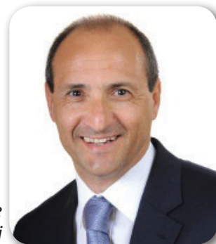
Onor. Christopher Fearne Chairman tal-Kumitat Permanenti dwar l-Affarijiet Barranin u Ewropej