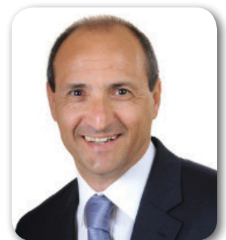
Hon. Christopher Fearne Chairman of the Standing Committee on Foreign and European Affairs

In Malta I also hold meetings with ambassadors accredited to Malta. It is a privilege for me to chair the Standing Committee on Foreign and European Affairs and I wish to take this opportunity to thank the Minister for Foreign Affairs, Hon. George Vella, Hon. Luciano Busuttil, Hon. Ryan Callus, Hon. Marlene Farrugia, Hon. Carmelo Mifsud Bonnici, Hon. Marthese Portelli, Hon. Silvio Schembri and Hon. Francis Zammit Dimech for their input and collaboration as Members of this Committee.