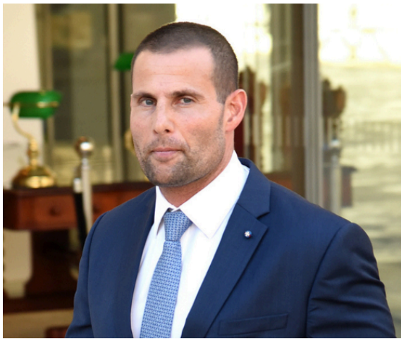
Opinion: justice under siege Jacques René Zammit