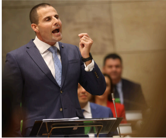
Opinion: Abela's dead cat Kevin Cassar