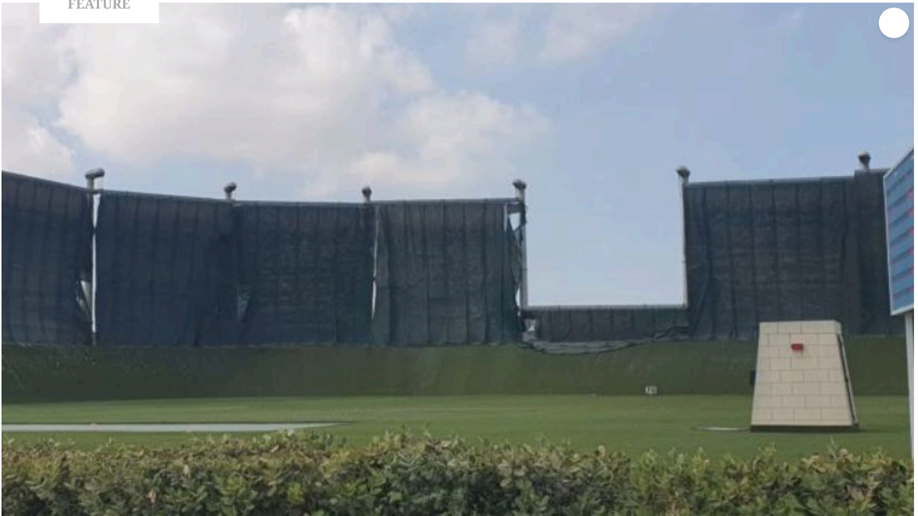
The Ta' Kandja shooting range in disuse after a 13 million project