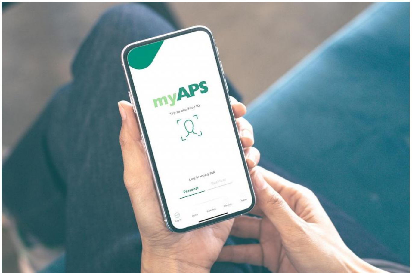
Improved channels: bringing banking to the community