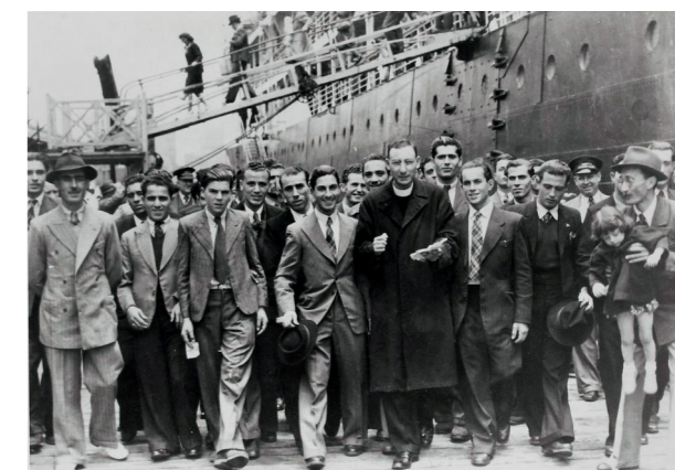
A group of Maltese immigrants disembarking in Sydney from the SS Partizanka in 1948

Maltese governments helped the thousands of prospective migrants financially such as by granting allowances to families whose breadwinner had emigrated and by assisted passage schemes. The local Church also supported migrants through the setting up of an Emigrants Commission in the 1950s which operated from Palazzo Carafa up to 1972, helping migrants to prepare themselves for life in foreign countries. This form of emigration began to decline from 1966 with many former migrants returning to settle in Malta after many years abroad. A new form of migration has now become common due to Malta joining the European Union where free movement and settling in EU countries is relatively uncomplicated and new opportunities have become available for Maltese to find a future on the European continent.