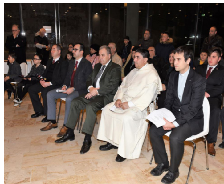
Wirja ta' presepju "Christus Natus Est" imtelligha mis-Socjeta' Filarmonika l-Unjoni ta' Hal Luqa għewwa l-Parlament bejn it-12 ta' Diċembru u s-7 ta' Jannar.