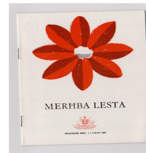
A booklet of 1967 assuring the Maltese emigrants that they were welcome in Australia