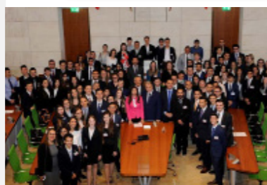
Qoxra: Studenti tal-iskola Post-Sekondarja Giovanni Curmi Higher fil-Parlament.