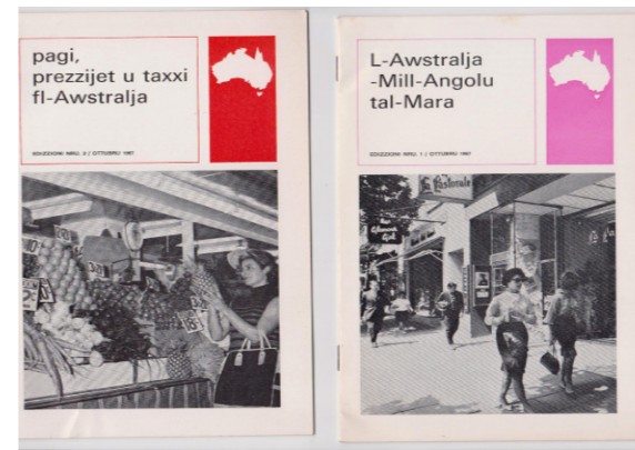
Żewġ fuljetti bil-Malti li jispjegaw diversi aspetti tal-ħajja Awstraljana lill-migranti prospettivi

Illum il-ġurnata, grazzi għas-šhubija ta' Malta fl-Unjoni Ewropea, daħlet sew forma ġdida ta' migrazzjoni fejn il-moviment liberu u l-issettiljar fil-pajjiżi tal-UE huma relattivament sempliċi u nfethu opportunitajiet godda għall-Maltin biex isibu futur fil-kontinent Ewropew.